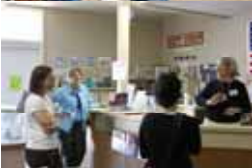
Volunteers help in so many different ways!