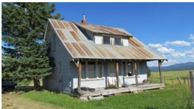
THE MAHALA HOUSE, CIRCA 1920