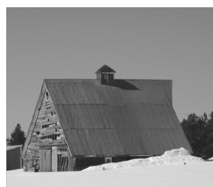
Sackerman Barn at it's current location near McCall

The festival brings hundreds of people to Roseberry each year to enjoy three enchanted evenings of grass-roots produced entertainment.